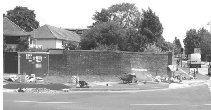
Dropped curb being installed

Of course, there has been much action recently to improve cycling and pedestrian routes in Emsworth. Readers will have noted the recent changes to road layouts, pavements and crossings in Emsworth, which were carried out by Hampshire County Council. This work is now complete although we are still working with HCC to address concerns raised by ECB and local councillors. There is still hope that funding can be found for an extension of the cycle lane on the A259 as far as Bridge Road in place of the unsatisfactory 'red patches'.