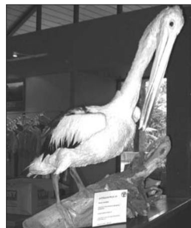
Pete the Pelican died at Kiama after swallowing plastic bags.

To many people Modbury might as well be Timbuktu but less well known. For green campaigners it has become a place to praise and hail as the future. In April, Modbury (population 1550) in Devon became the first plastic-bag-free town in Britain.