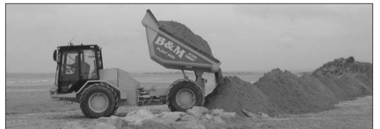
Work starts at East Head

By the time you read this, temporary work should have been completed to strengthen the 'hinge' at East Head. The terminal groyne on West Wittering beach will also be shortened and lowered to allow more material to naturally reinforce the 'hinge'.