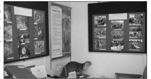
Wild life displays

A copy of the historical research will be given to the museum at a later date. In addition, BMCG plans to publish a booklet containing historical data, memories of local people, maps and photos serving as a permanent record of 'Brook Meadow Through the Ages'. It is hoped that the booklet will be on sale later on this year.