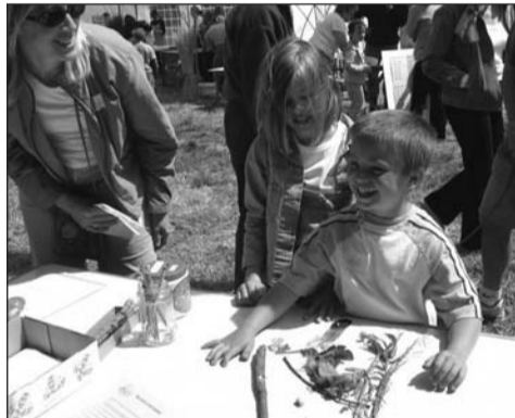
Happy nature hunt collector

With a team of 22 very willing and hard working volunteers, five dedicated and very enthusiastic workshop leaders and glorious weather, the 4th annual Brook Meadow Wildlife Funday was set to be a great success. And with at least 460 visitors - it most certainly was! This year's Wildlife Funday was part of Havant Borough's 'Making Waves' Arts Festival 2005 and was funded by the Peoples Places Award Scheme.