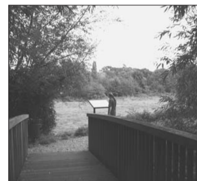
Brook Meadow from North Bridge

All the main events and improvements described above have been financed from grants. Our biggest award being the Peoples Places scheme (approx. £10,000), which dispenses mainly lottery money. Membership subscriptions and donations provide about a third of the group's income enabling us to pay for all our regular expenditure. However, the group still needs to find funding to continue putting on the annual public events such as those mentioned above.