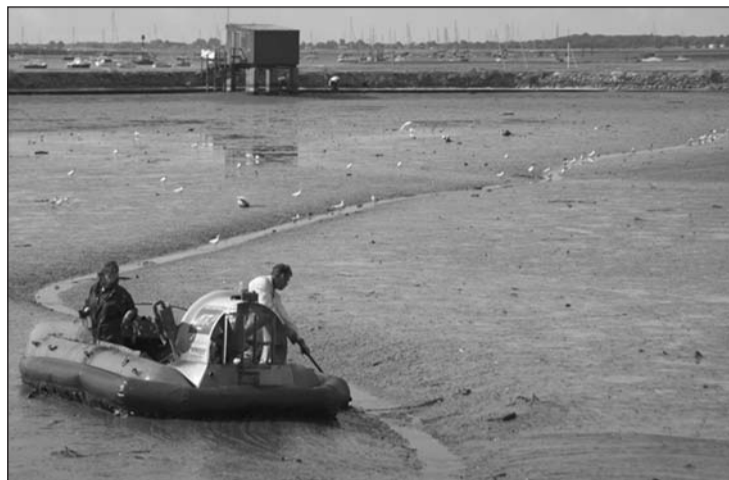
Hovering up the Rubbish

I never expected to see a Hovercraft on the Town Mill Pond - but last month, it happened. Able to hover all over the pond, it was possible for a thorough clean-up to be carried out and many years of rubbish was deposited in the HBC lorry.