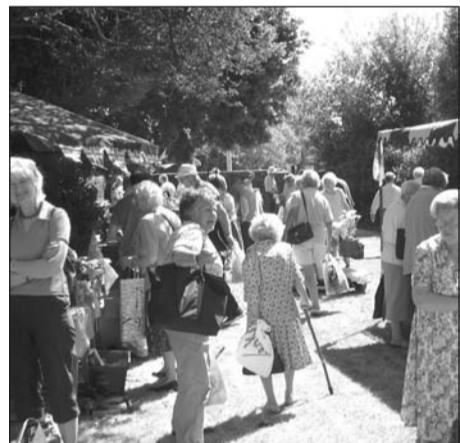
Emsworth Hospital Fete.