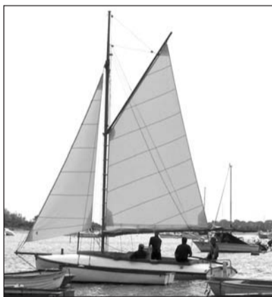
The Terror under sail after her launch and blessing at the Emsworth Food Festival.