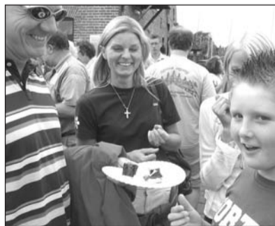
Visitors from Clanfield enjoy a plate of sushi from 'Oi! Sushi' on the quay.