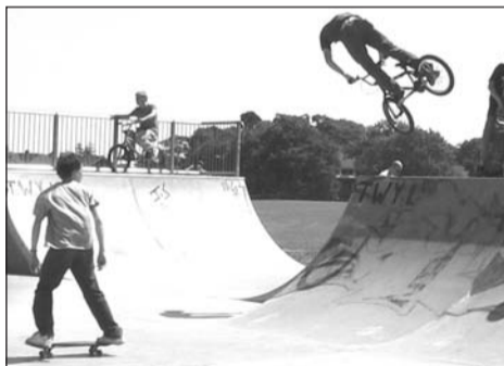
Skilled BMX rider competing at the skatepark opening.

Graffiti art is a fundamental part of skatepark culture and a number of extremely skilful examples appeared within days of the ramps being completed. Unfortunately, there were also a lot of crude and offensive scrawls.