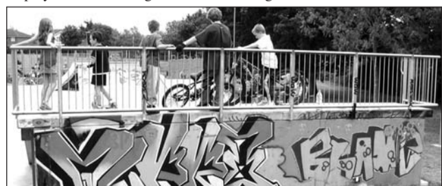
Younger children: boarders, skaters and BMXers sharing the skatepark with 'graffiti art' setting the scene.