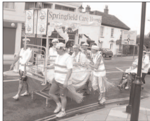
Springfield Nursing Home stage their own event in aid of St Wilfrid's Hospice

At the July ERA QGM, members of staff from the Rowans Hospice at Waterlooville and St Wilfrid's Hospice at Chichester described palliative care and support services available in East Hampshire and West Sussex. They described how they care for those in need and their supporting family.