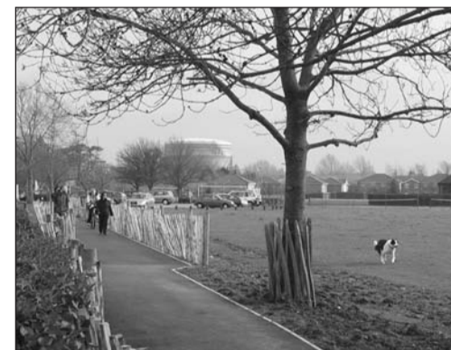
New cycle path in Jubilee recreation ground

'No Cycling' order in Jubilee Park so that cyclists can travel from St James' School along the new path to the car park and then continue on to Washington Road via the park border path and the underpass. This route utilises existing Footpath 71. When completed, it will be the only safe route for cyclists from northern parts of Emsworth to the town centre since it avoids the dangerous passage under the railway bridge across North Street. It is hoped to implement this route in the near future. One other piece of work to be done is the widening of the pavement outside St James' School to provide easier access to the marked crossing on Horndean Road. This will be carried out when further funds can be found.