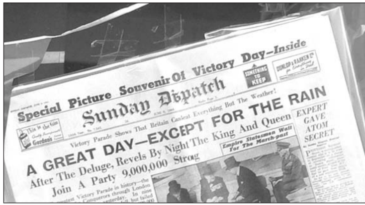
This Sunday Dispatch headline in Vitalise window really summed up the day!

For a week before the event day itself, the shopping centre was awash with forties memorabilia with some 18 shops entering the Window Display Competition. And what fabulous, imaginative, informative displays there were too. On the day they provided the perfect setting for the WWII jeeps and trucks.