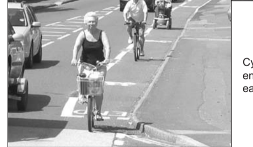
Cyclists and a mobility scooter enjoying the extension of the eastbound A259 cycle lane