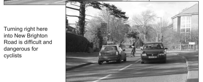
Turning right here into New Brighton Road is difficult and dangerous for cyclists