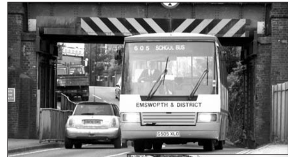
Little room for cyclists under this narrow bridge

Views and comments on cycling issues had already been obtained from 22 people who attended a Green Living Fair in November 2006. 24 other people provided comments in response to articles in the local press. These comments were used to help identify the routes to be surveyed, and the types of issue to be included in the audit.