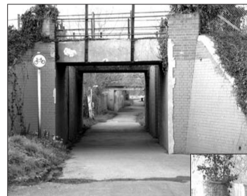
Footpath 71 from Washington Road needs safety improvements and shared use designation