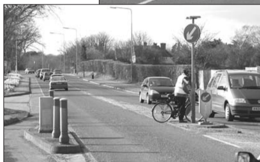
Should the cyclist risk his front or back wheel on this narrow refuge? It's a harder decision for a mother with a pushchair