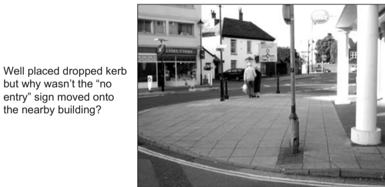
Well placed dropped kerb but why wasn't the "no entry" sign moved onto the nearby building?