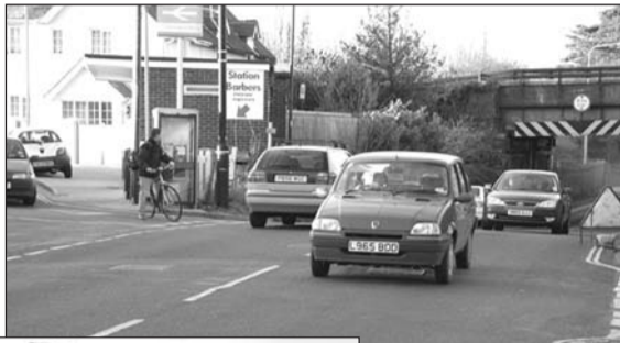
Station users have to run the gauntlet of rush hour traffic here and north of the A27 road bridge

in many places despite some recent patching up. The lack of maintenance is due to the high cost of the coloured surface dressing. It is suggested that HCC Highways Department acknowledges reality and dispenses with coloured cycle lanes in order to allow more regular maintenance. This is not a matter of aesthetics; poorly maintained cycle lanes are difficult to ride on, they force cyclists into the main traffic stream and generally deter potential cyclists from using their bikes.