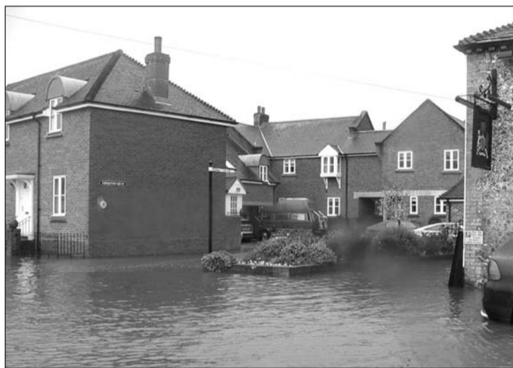
Flood in Emsworth 10 March. Modern houses built above the flood level have no insurance problems even when surrounded by water.

National Planning Guidance sets out how flood risk should be considered at all stages of the planning process to reduce future loss of life and damage to property from flooding. Havant Borough Council is producing a Local Development Framework, including a Strategic Flood Risk Assessment, which should identify appropriate sites for future development.