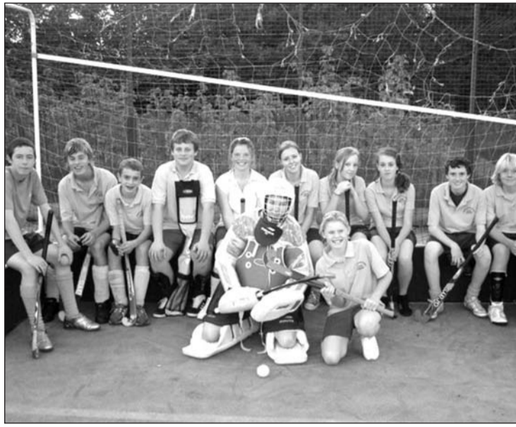
Warblington School Under 16 Mixed Hockey Team